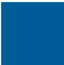
PCOM BLUE PANTONE 301 CP CMYK - 100, 53, 4, 19 RGB - 0, 68, 141 WEB - #00448D