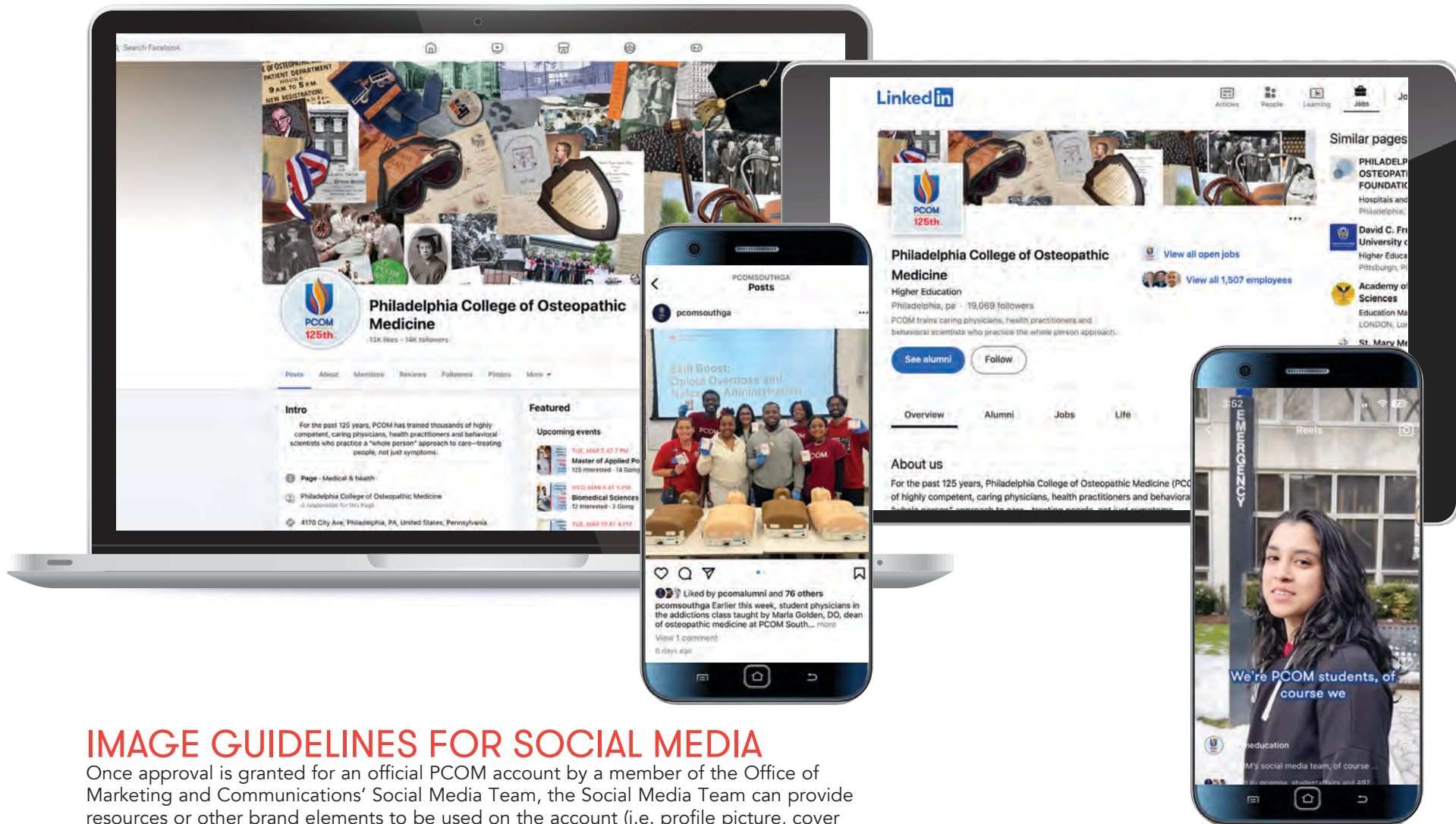
IMAGE GUIDELINES FOR SOCIAL MEDIA

Once approval is granted for an official PCOM account by a member of the Office of Marketing and Communications' Social Media Team, the Social Media Team can provide resources or other brand elements to be used on the account (i.e. profile picture, cover photo, icon, background, etc.), and other guidance, including steps to obtaining proper imagery (such as profile photos/icons, cover images, etc).